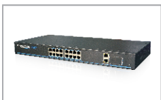
16 Ports Managed PoE Switch SW16-TP300 • Uplink 1000Mbps, downlink 100Mbps • PoE+; distance up to 150m

This item is a 24-port managed PoE Ethernet switch, which provides 24x 100Mbps downlink PoE Ethernet ports, supports IEEE802.3 af/at and 2x 1000Mbps uplink Ethernet ports. It supports Layer 2 network management and PoE management based on web and provides high-speed data forwarding. It is widely used in security surveillance, network engineering projects and so on.